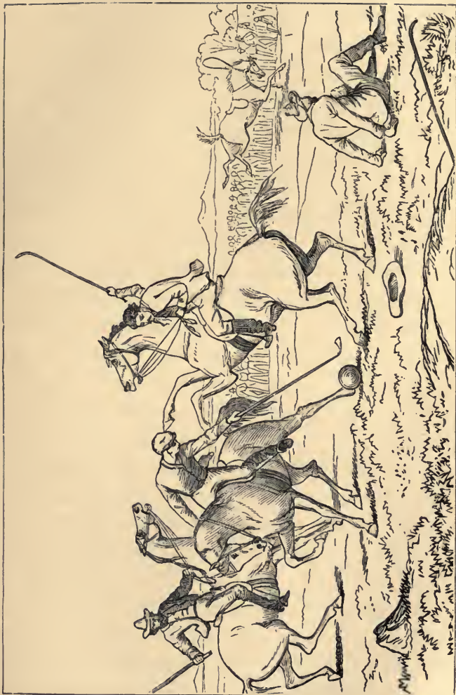
POLO ON THE PLAINS.—PAGE 166.